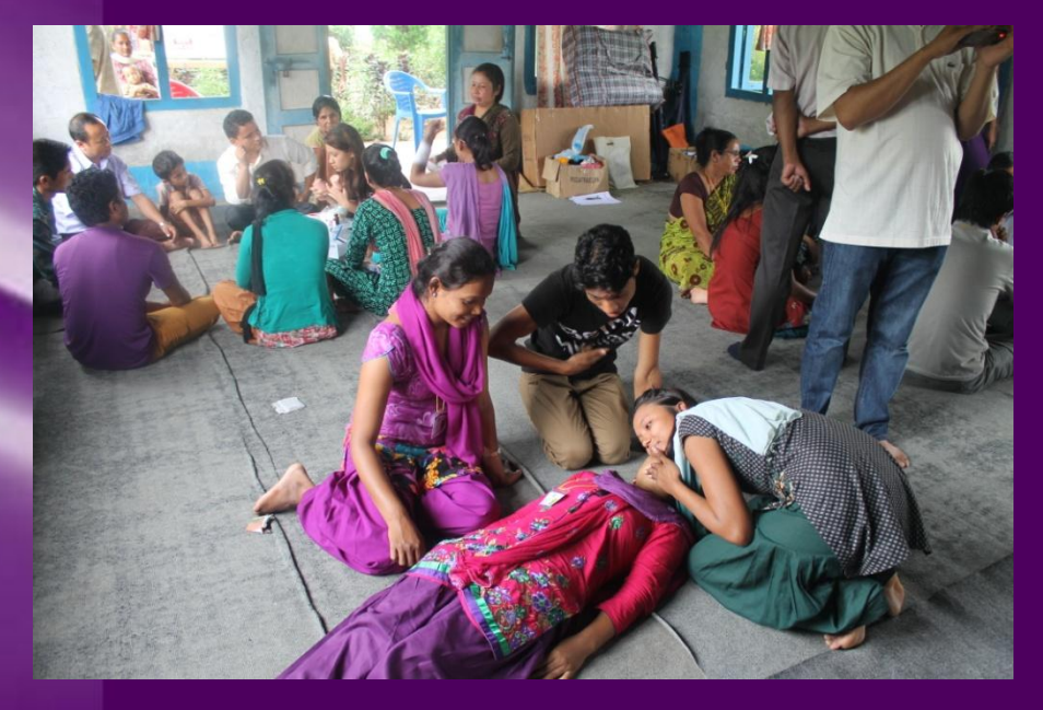
Practicing ABC by trainees