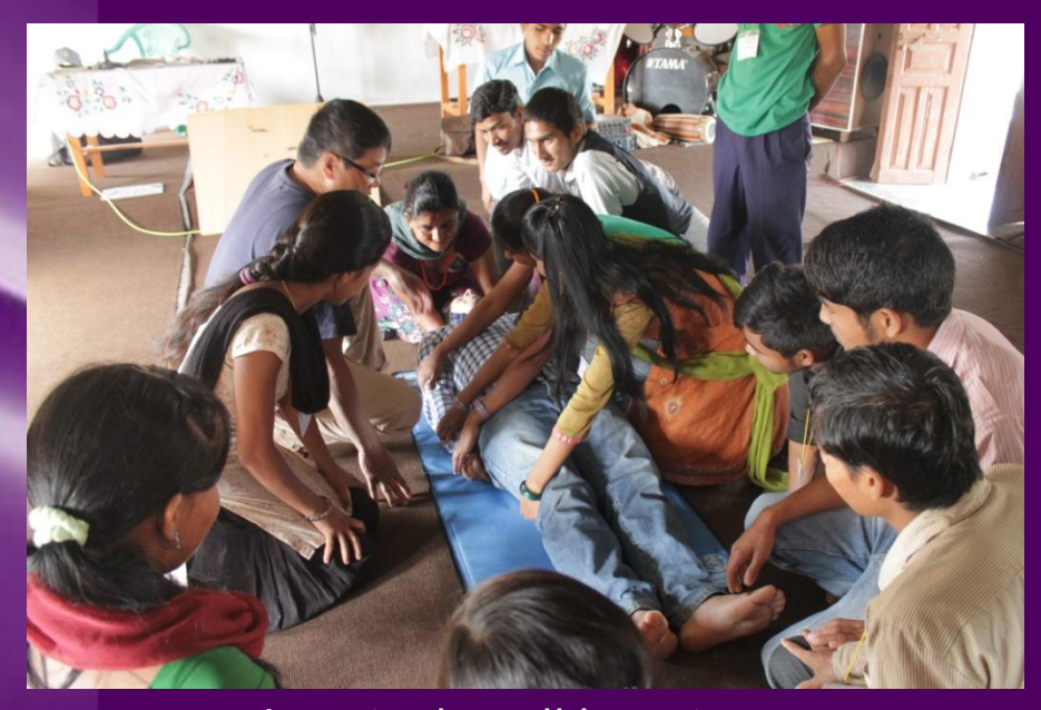
Learning log roll by trainees