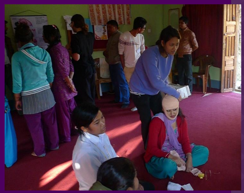
Practicing bandaging by trainees