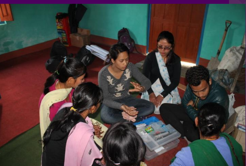
Learning to use first aid box