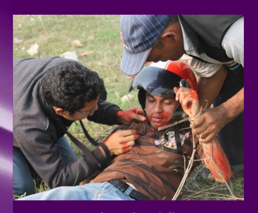
Mock accident drill