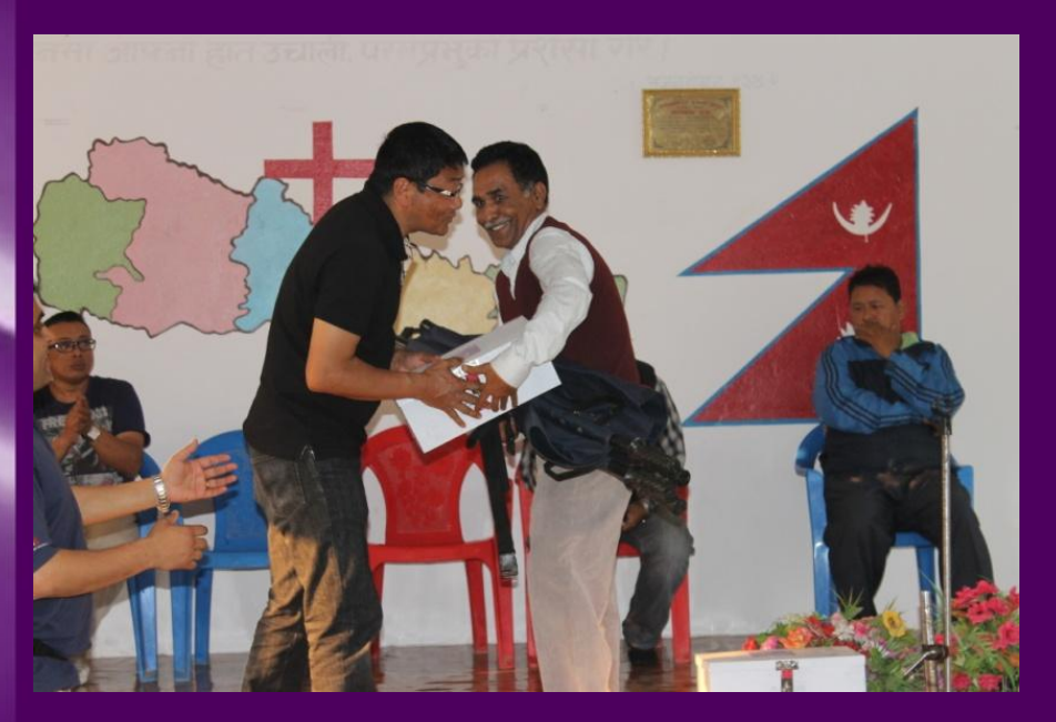
Handover of the first aid box and stretcher to the church pastor