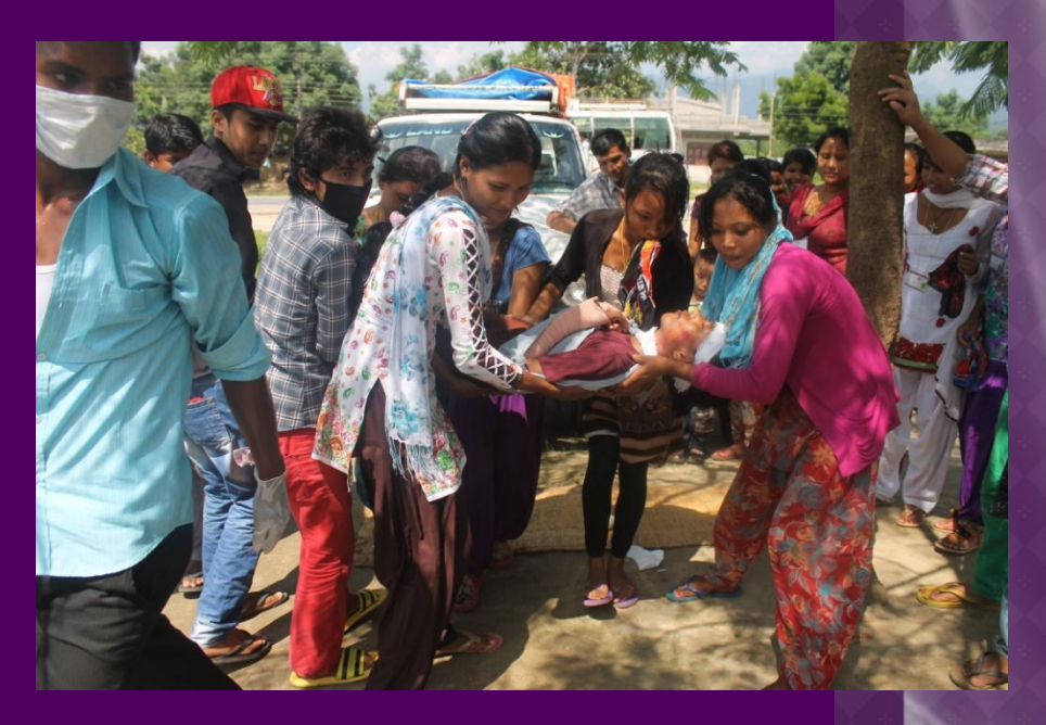
Mock accident activities