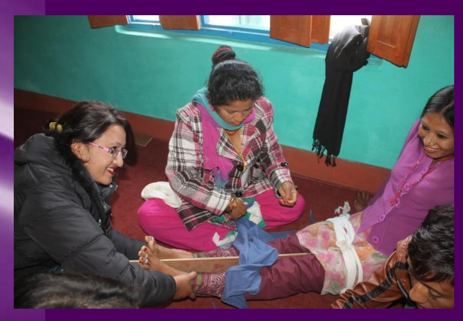
Practicing splinting by trainees